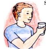
Answer to puzzle on front: will never thirst. "Christ died" difficulty, might, courage, God, "Christ died" answer to puzzle inside: because, hearts, spirit, given, still, time.

When you have a drink of water, think about how your body needs water to stay alive, and how your soul needs God's grace. Saying a prayer is kind of like giving your soul a little drink!