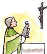
Answer to Word-Find: We are one body in Christ.

What is your job in the Church right now? What do you think it will be when you are grown up?